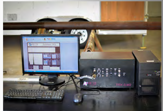
TRX Platform Electronics: TRX Scope, Computer, Monitor, and Soft-

The TRX Platform UT Scopes™ is New Tech Systems ground breaking UT scope developed in-house specifically for the OCTG inspection industry. For many years the OCTG inspection industry has been utilizing UT scopes that were developed for use by many different industries (aerospace, pipeline, refineries, etc.), and as such the UT scopes had many settings and were very complicated to setup and operate. The TRX platform UT scopes can be easily configured by entering in a few values such as nominal wall and setting the gates. Setup can be performed in minutes as many of the complicated settings and calculations are performed automatically by the software. The TRX platform scopes are capable of I.D. and O.D. flaw differentiation and inspection results are displayed on an easy to read chart. In addition, the TRX scope can display the analog events like traditional UT scopes or display events only indicating when a flaw is detected. An optional dual scanner setup is available to allow simultaneous scanning of the pin and box. The TRX scope is a game changer in the industry due to its simple setup, calibration, and ease of use.